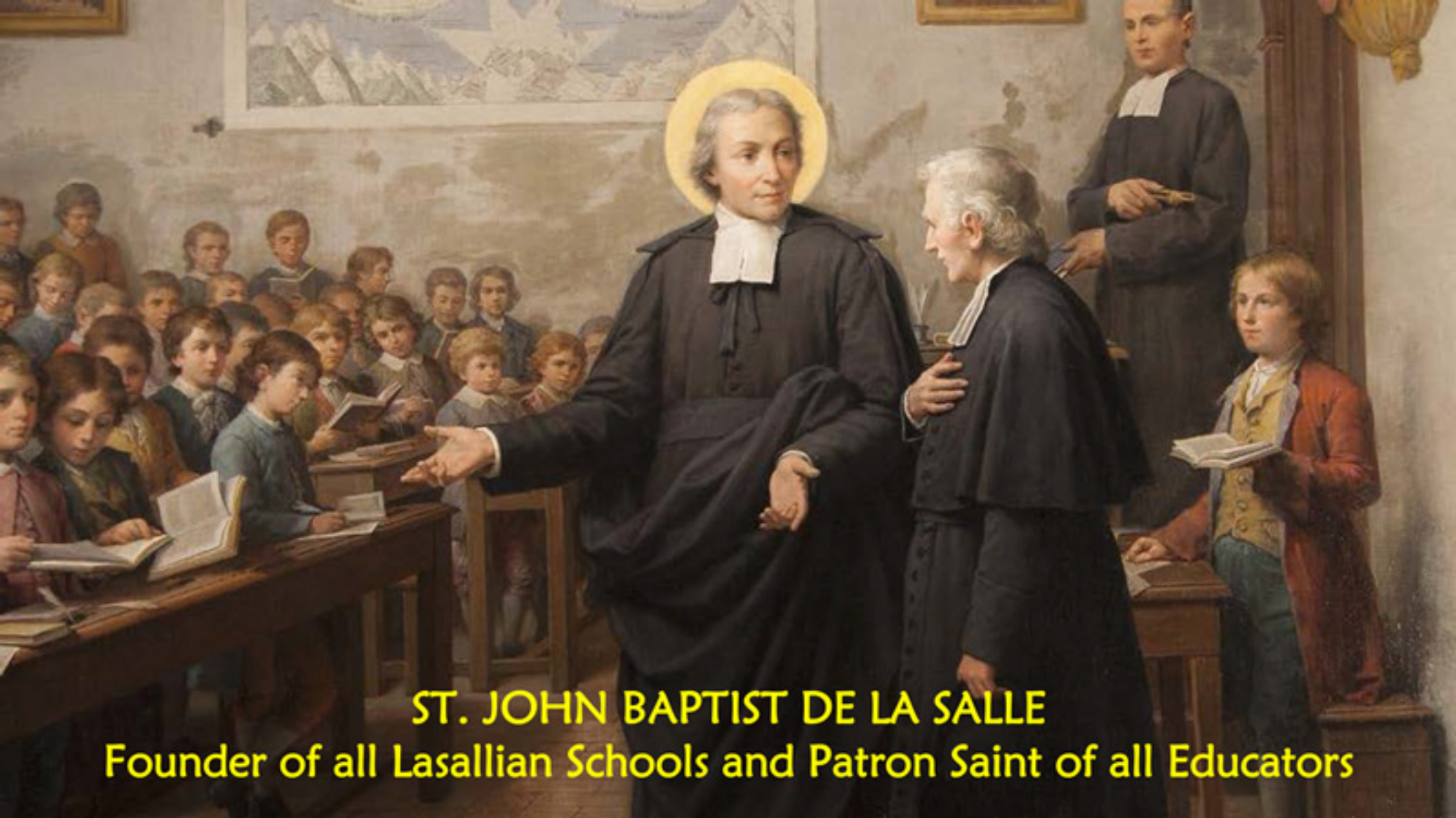
ST. JOHN BAPTIST DE LA SALLE Founder of all Lasallian Schools and Patron Saint of all Educators